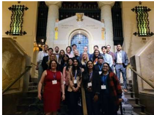
26 Registered (21 attended)