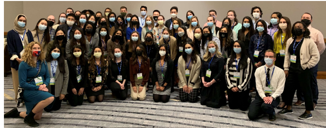
2022 program participants in Phoenix, AZ