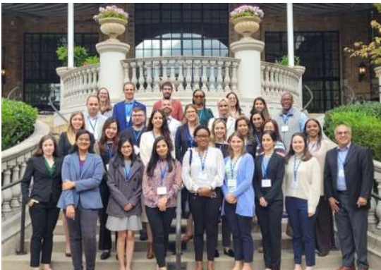
25 Registered (19 attended)